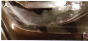
Lens Fog build up

Manufactures note: Condensation is a common problem that all car light manufacturers encounter. As climate changes, the humidity in the headlights can cause the fog. Once the headlights are turned on, the heat produced from the bulb will cause condensation.