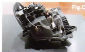
Never place the lens down