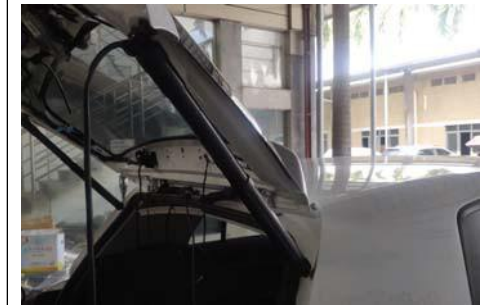
10. install our electric tailgate