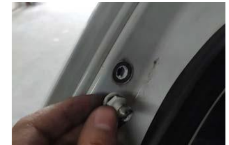
8. Remove the original car body ball head (same left and right)