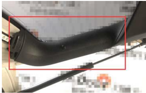
3. Remove the sides trim