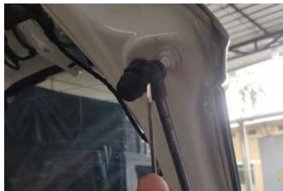
5. Pry open the gas spring circlip and remove the original car pole (same for left and right)