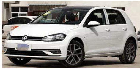
1. Golf 7 Car appearance