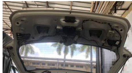
4. Remove the rear tailgates trim