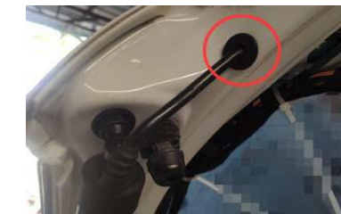
12. Pierce the strut wire into the reserved hole, and plug the rubber plug (the same left and right).