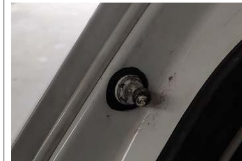
9. Add a gasket of our company on the basis of the ball head of the original car (same left and right)