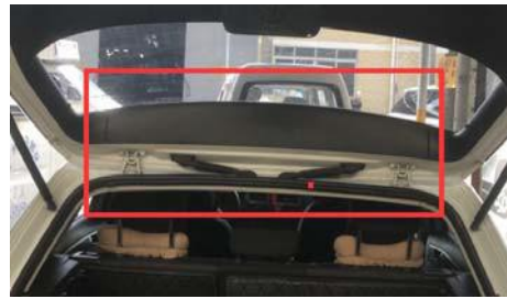
2. Remove the main trim of the tailgate