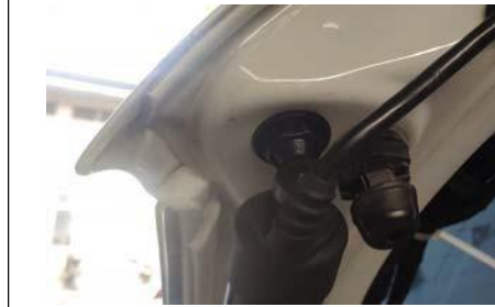
7. Our company is equipped with ball head (the same left and right)