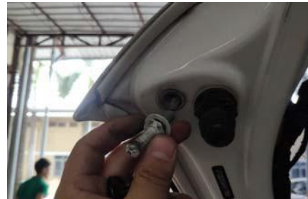
6. Remove the original rear door ball head (same left and right)